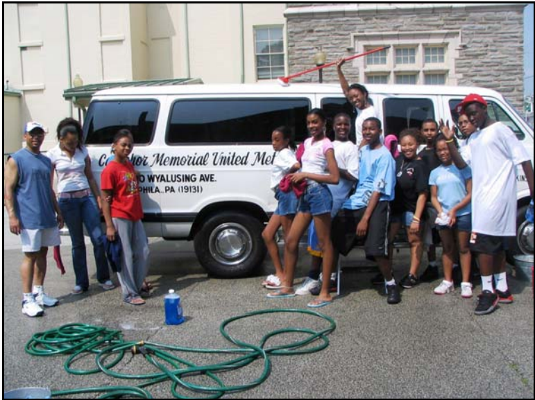
Camphor Youth held a Car Wash in the church parking lot on June 10, 2005. They not only gave the church vans the royal treatment but also had lots of fun raising funds for trips and conferences they plan to attend in the Fall.